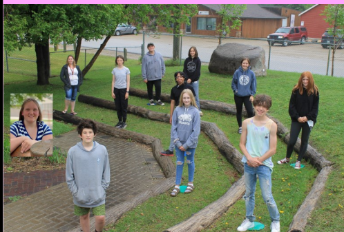
Enjoy your summer break and all the best to the grade 8's next year at ECI!