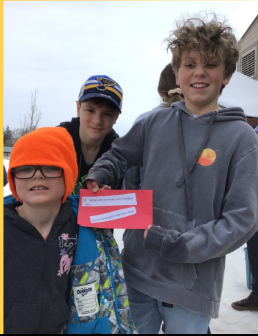
Scavenger Buddies Hunt